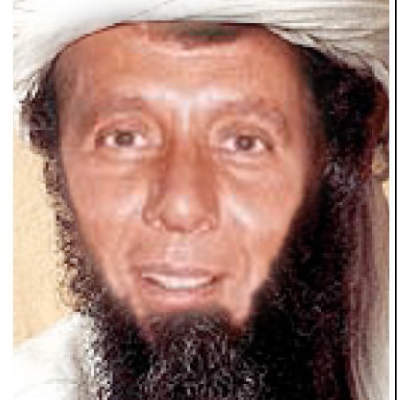
OSAMA BIN BARBA