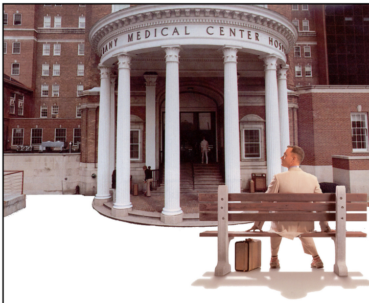
Research scientist, packs bag and flees Albania

Albanian Secret Police photo of the Albanian Greyhound Bus Station. Suspect is shown prior to boarding a bus for Canada.