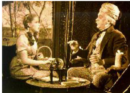
THE AMAZING DR. MARVEL OF THE ALBANIAN MEDIEVAL COLLEGE MEETS DOROTHY OF KANSAS

Dr. B.G. Marvel of the Albanian Medieval College (AMC) has, at the request of the WHN , conducted in depth studies in the state of Kansas regarding evolution of the anti-evolution movement. According