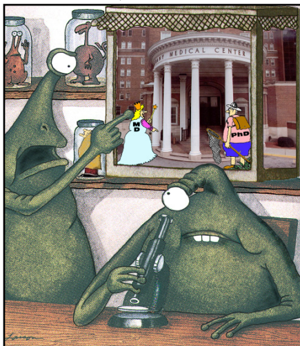
This one looks tasty and its well dressed! I'll take it!