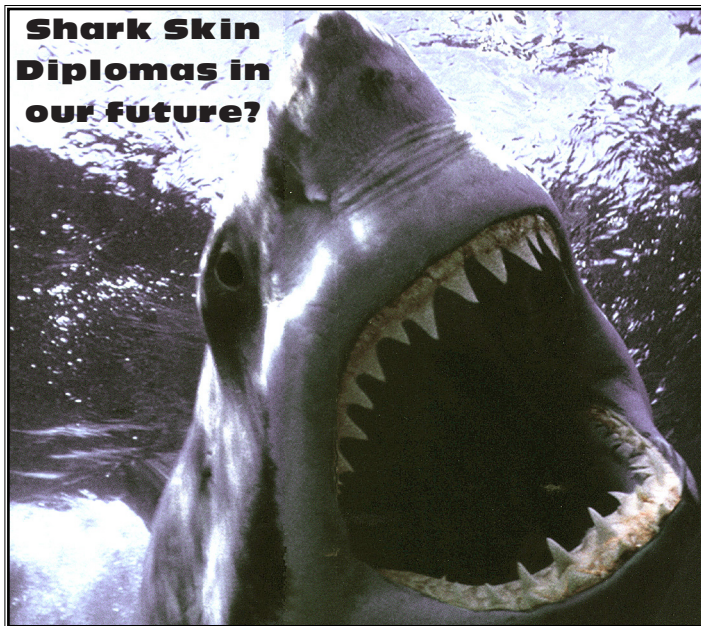
Shark Skin Diplomas in our future?

Albania ( WHN ) In an effort to diversify the business and financial base of the Albanian Medical College , the Administration has looked to SEAWORLD USA . While this seemingly incongruously pairing has surprised many, Herr Doktor Manfred von Mengele, Administrator, has stated that it is in fact an obvious alliance. “As von kan see by da lots of surgeries ve do, ve gots lots of extra body parts...vat do you do wit dem? Ve kan only use so much in da kafeteria so dat leaves udder carnivores. So ve chose da shark; kus dey is so cute -- and have da big big teeth.”