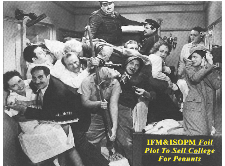
IFM&ISOPM Foil Plot To Sell College For Peanuts