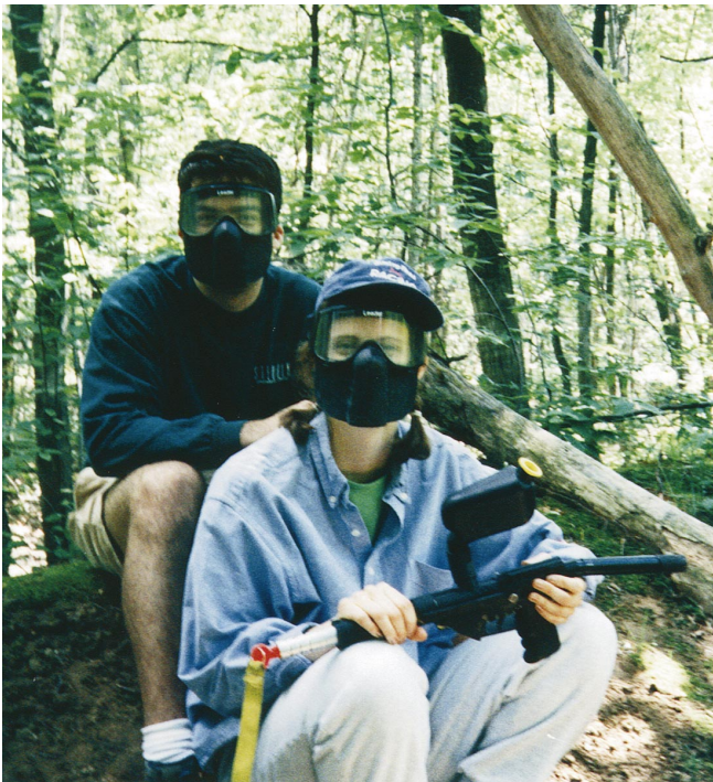
Militia leader “Commander Peg” meets with a WHN reporter in the Albanian Jungle. Also shown is Che Joe who is spreading the rebellion to the Wadsworth Brain Institute.

Albania ( WHN ) Unrest continues to well up in Albania as students at the prestigious Albanian Medical College threaten the faculty with reprisal unless their demands are met.