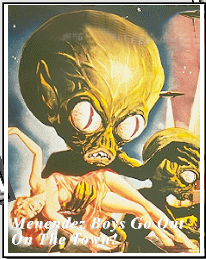
Menendez Boys Go Out On The Town!