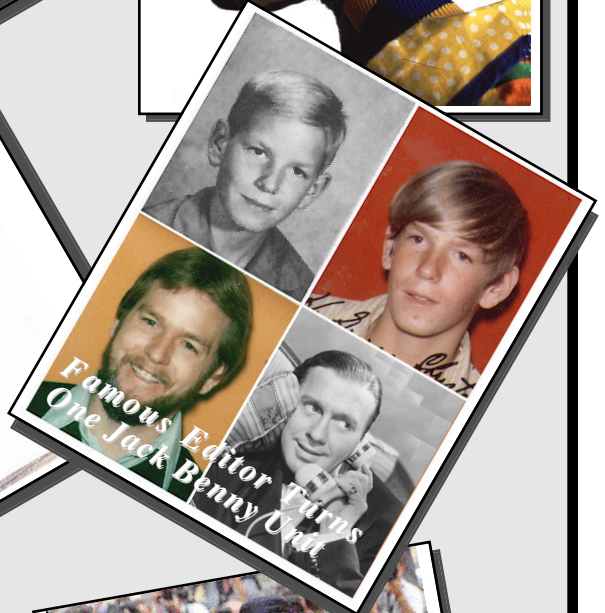
Famous Editor Turns One Jack Benny Out