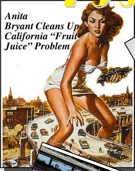
Anita Bryant Cleans Up California "Fruit Juice" Problem