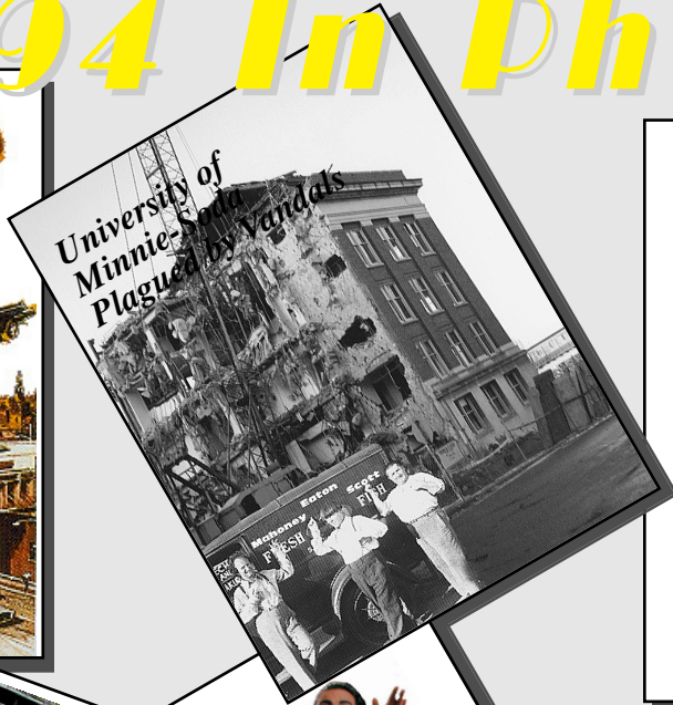
University of Minnie-Snow Plagued by Vandals