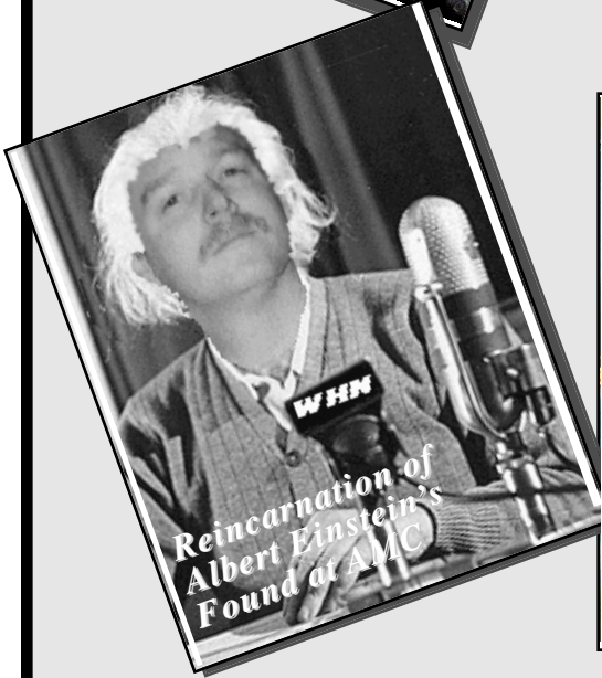
Reincarnation of Albert Einstein's Found at AMC