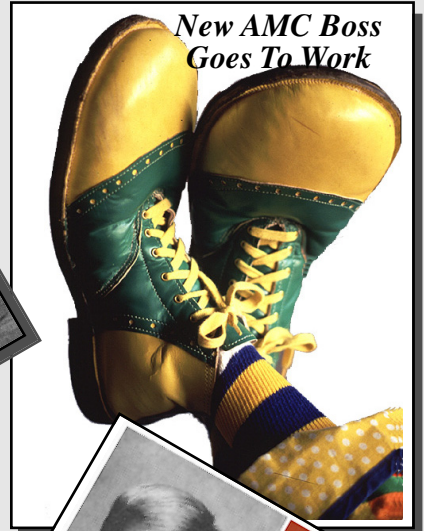
New AMC Boss Goes To Work