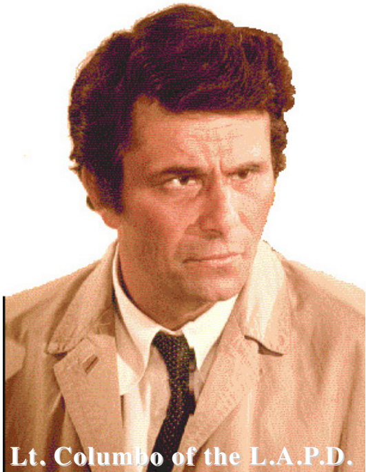
Lt. Columbo of the L.A.P.D.

see related story: New suspect sought in OJ Case