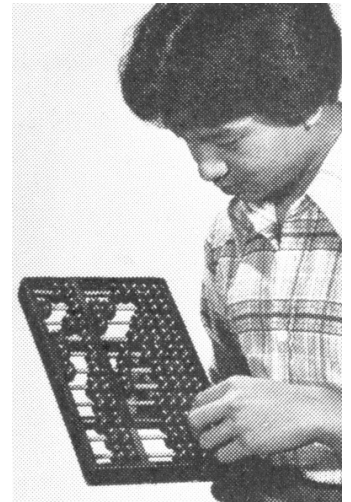
The Abacus 2000: a fully digitalized personal computer which contains the Pentel 586 Bead.