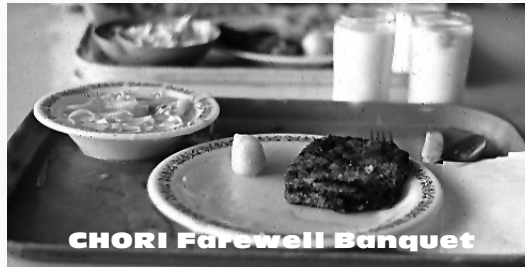
CHORI Farewell Banquet