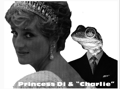
Princess Di & "Charlie"