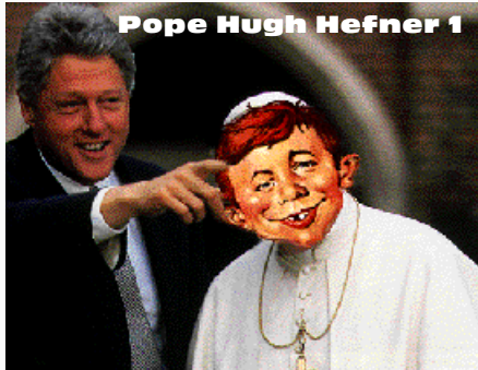
Pope Hugh Hefner 1